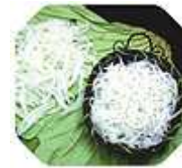
White bait(Ice fish)