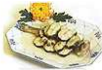
Yangtze herring (called Huiyu in Chinese)