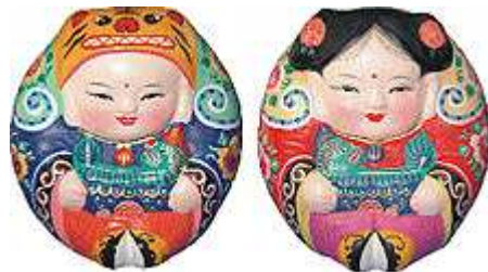
Afu, always in pairs, the representative Wuxi clay figurines