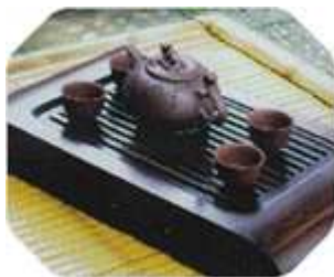
Tea-pots made of Yixing's red terra-cotta clay (also called purple sand terra-cotta)

Famed as “Little Shanghai”, Wuxi boasts brisk trade and commerce activities which are mostly carried out around the city center.