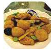
Stuffed Fried Gluten