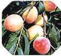
Wuxi's honey juicy peach