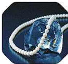
Taihu fresh-water pearls