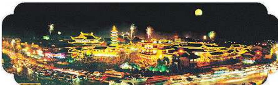
The Nan Chan Temple Zone of Culture and Trade