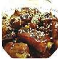
Wuxi Pork Spare-ribs